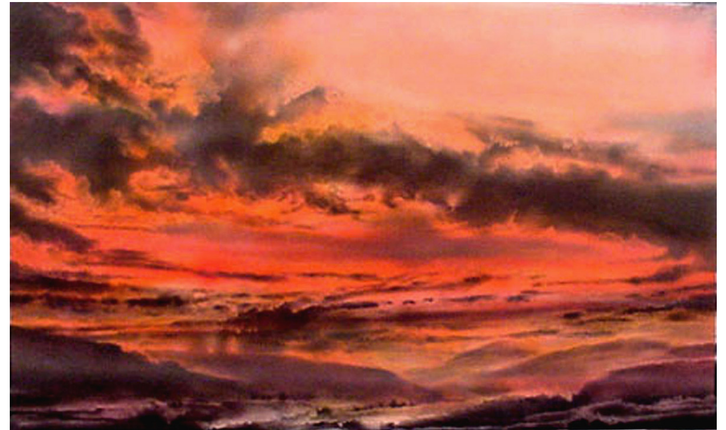
CONCERTO AT DUSK II CARBON AND WATERCOLOR ON COTTON MATBOARD 30" X 50"