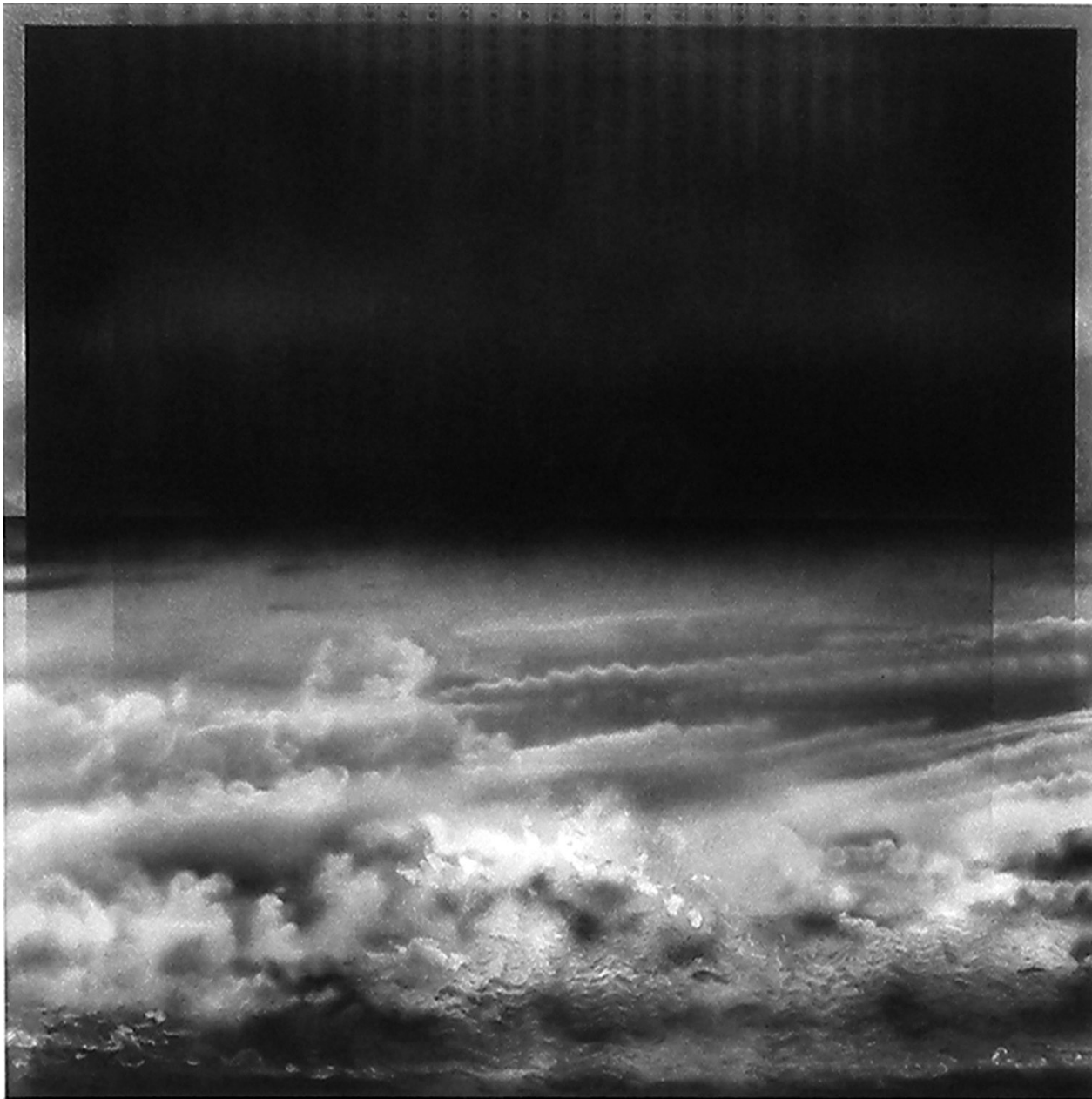
ARCHETYPAL LIGHTSCAPE CARBON AND ACRYLIC ON COTTON MATBOARD 20" X 20"

Because carbon is the basis of all life, I feel that it is the perfect medium to use in the creation of my art. My powdered carbon works reveal a timeless, archetypal landscape. The references and inspiration come directly from nature. My airbrush emulates wind and weather to create poems of light and illumination — visible and invisible.