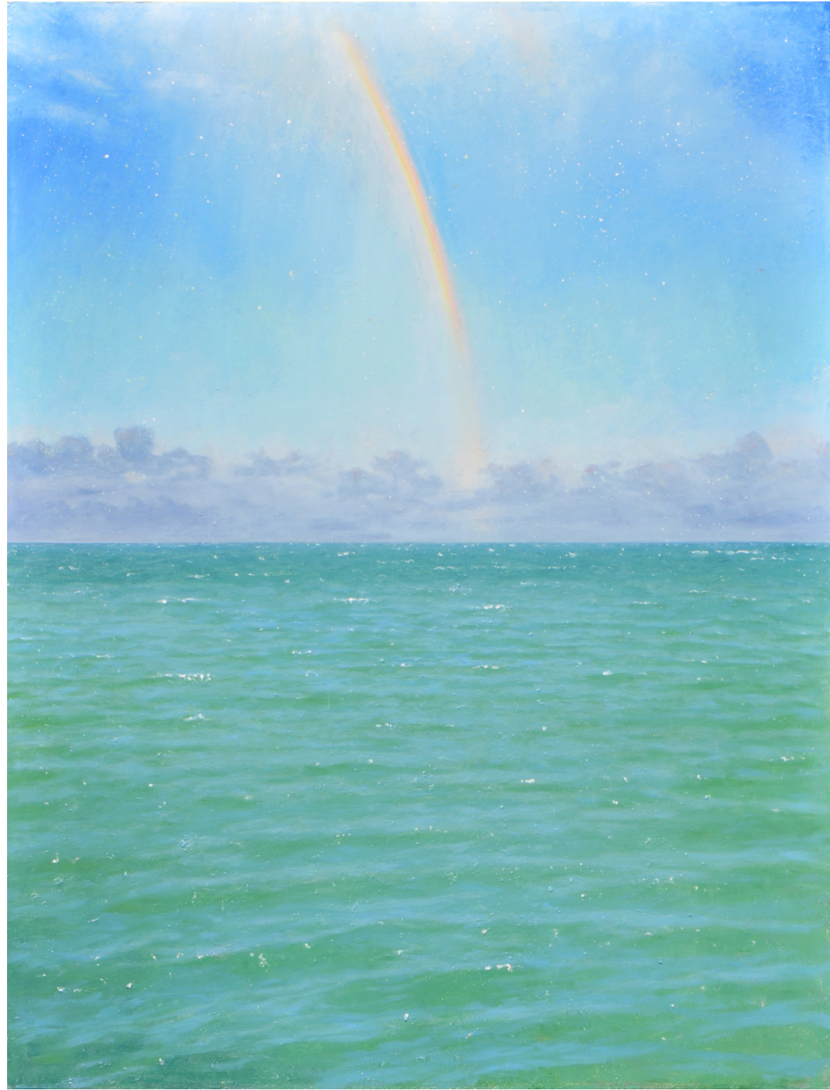
BROKEN DREAMS OIL ON CANVAS 48" X 36"