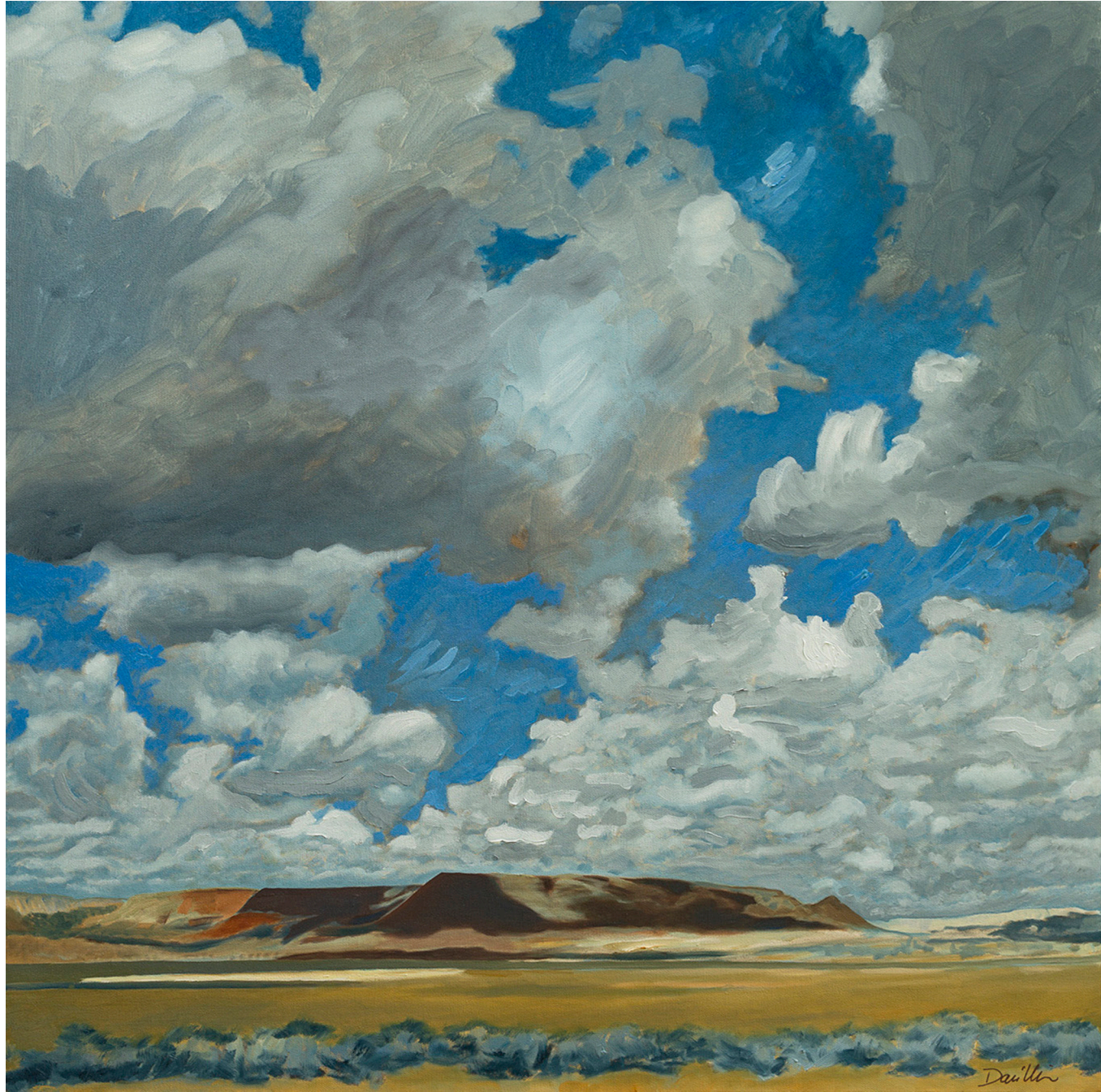
OPEN RANGE OIL ON LINEN 30" X 30"