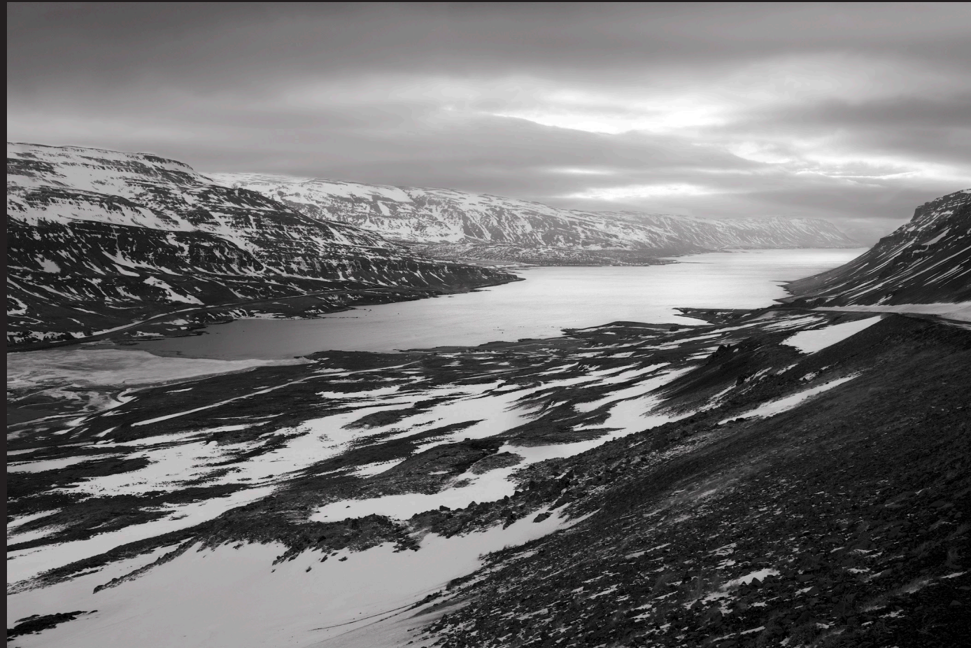
LANDSCAPE NO. 16 (ICELAND) INKJET PRINT, FACE MOUNTED TO PLEXIGLASS 23" X 34"