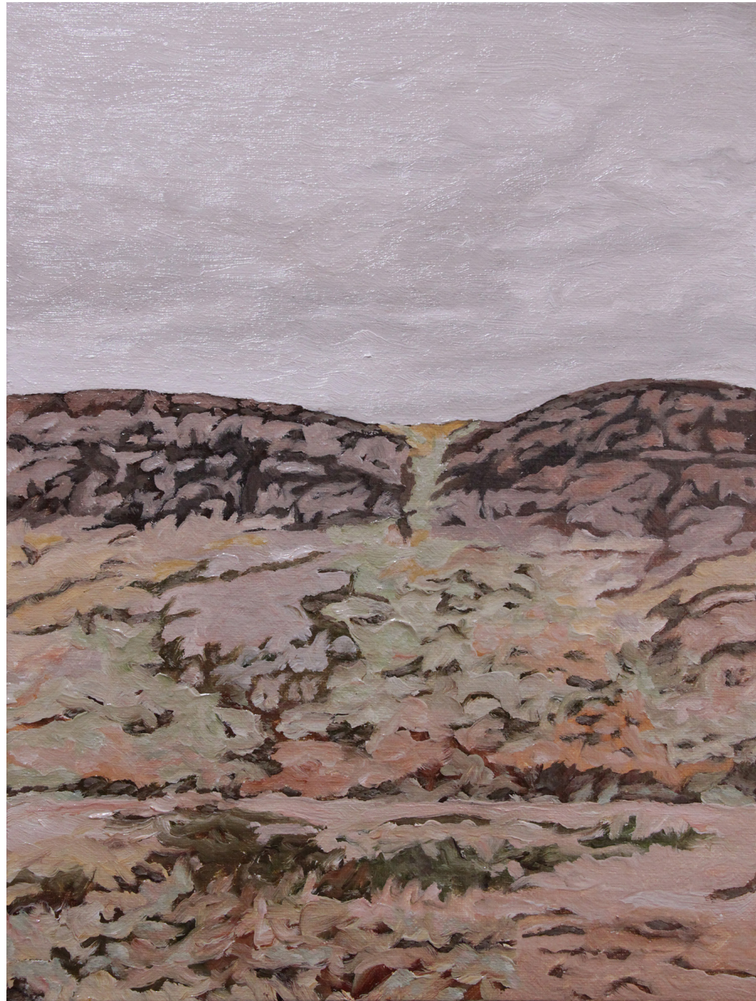
AC 8 OIL ON LINEN PANEL 12" X 9"