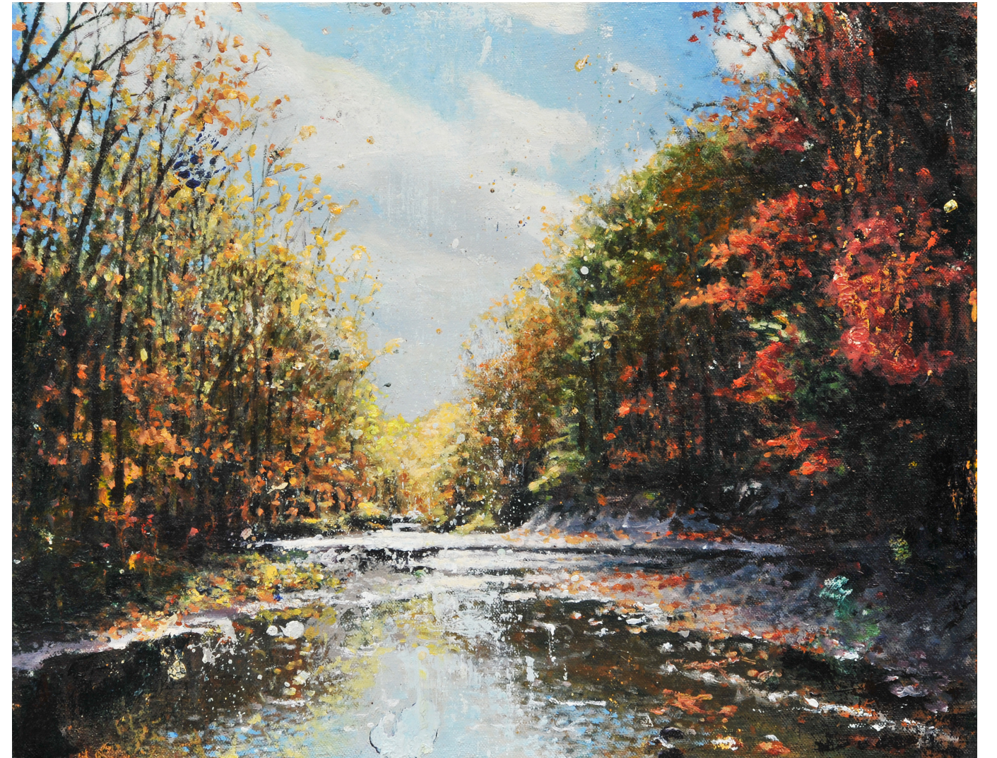
FALL FALLS OIL ON CANVAS 12" X 15"