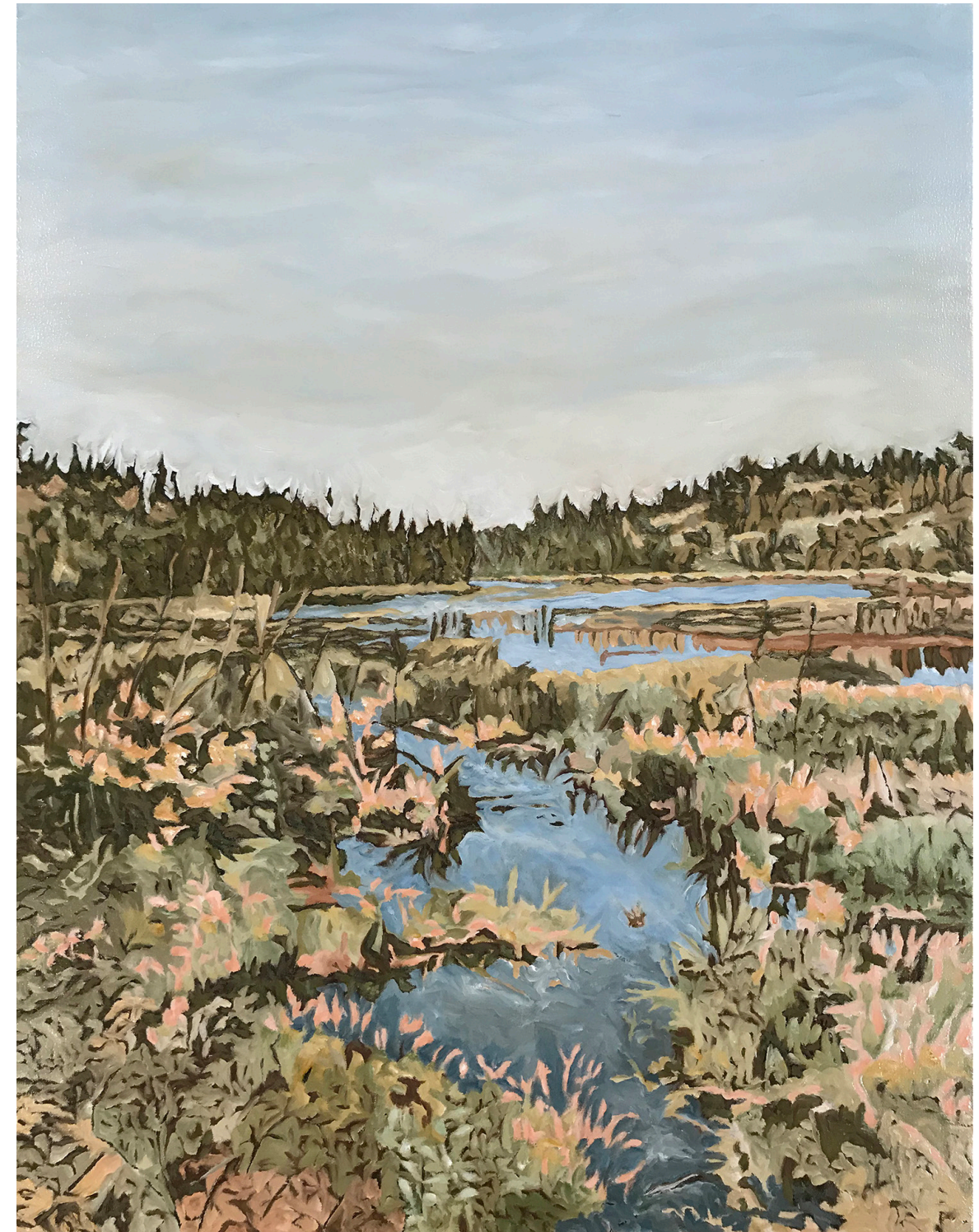
GLS 12 OIL ON CANVAS 36" X 28"

Paintings from this project, Ghost of Sea , meld images from one place with those from another to create an overall impression of the Plains. The paintings reflect my impression of the territory rather than document a particular site.