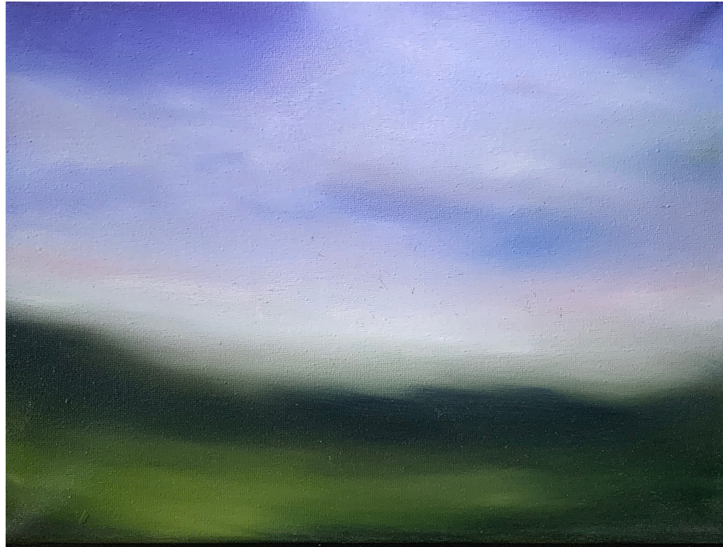
DREAMS OF ALASKA OIL ON CANVAS 9" X 12"