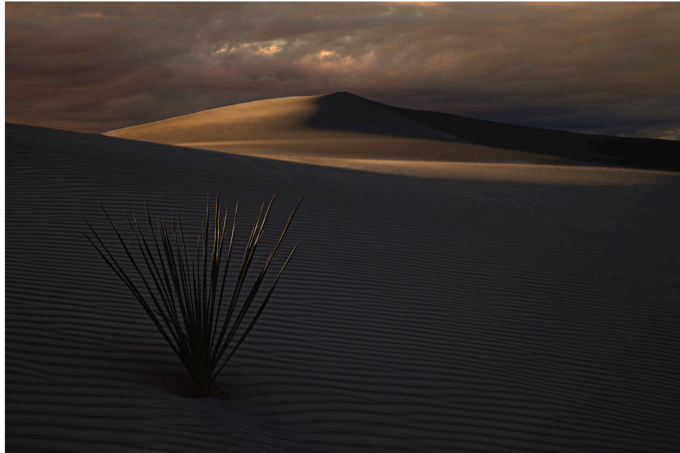
LANDSCAPE NO. 29 (NEW MEXICO) INKJET PRINT, FACE MOUNTED TO PLEXIGLASS 23" X 34"