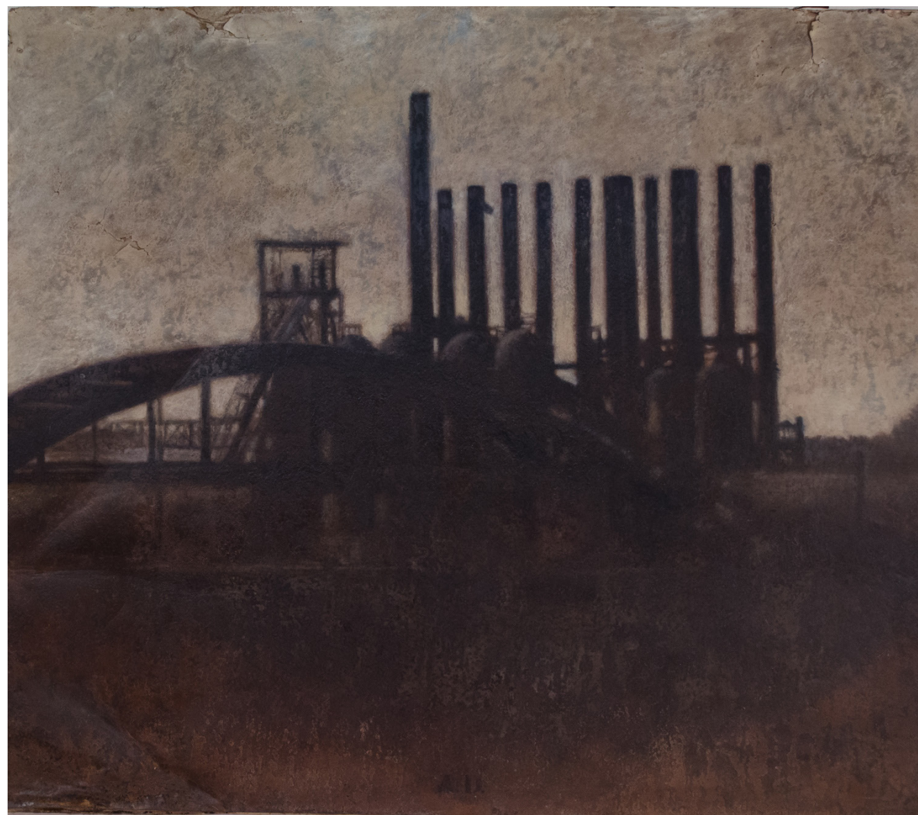
SHUTDOWN RUST, OIL ON STEEL 48" X 48"