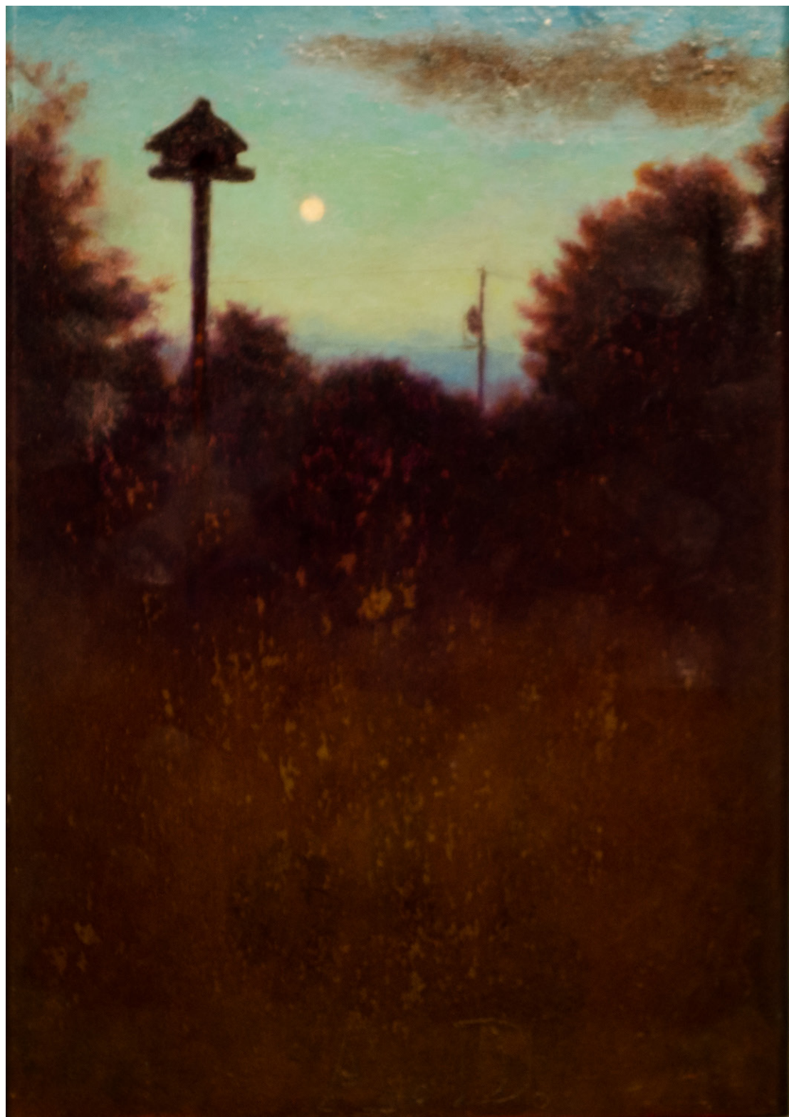
MARTIN HOUSE MOON RUST, OIL, WAX ON STEEL 11" X 8"