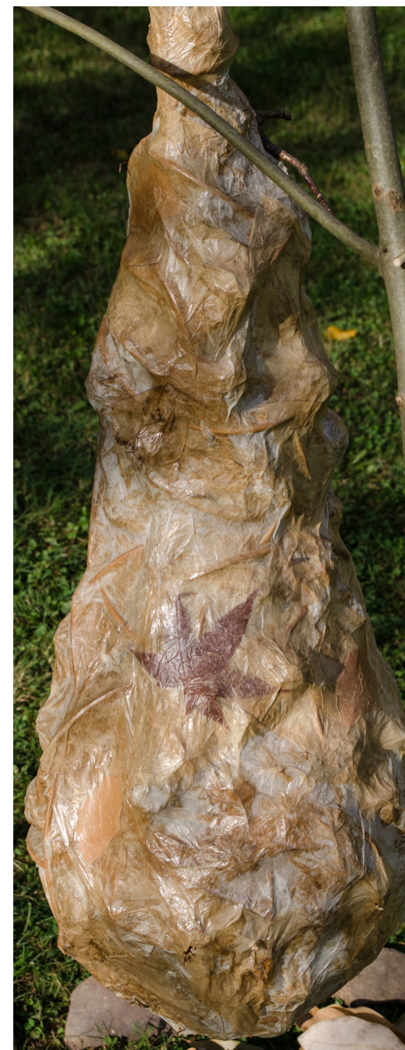
MEANDERINGS, DETAIL STICKS, VINE, SWEETGUM TREE PODS, LEAVES, PAPER, SINEW 120"H X 56"W X 46"D