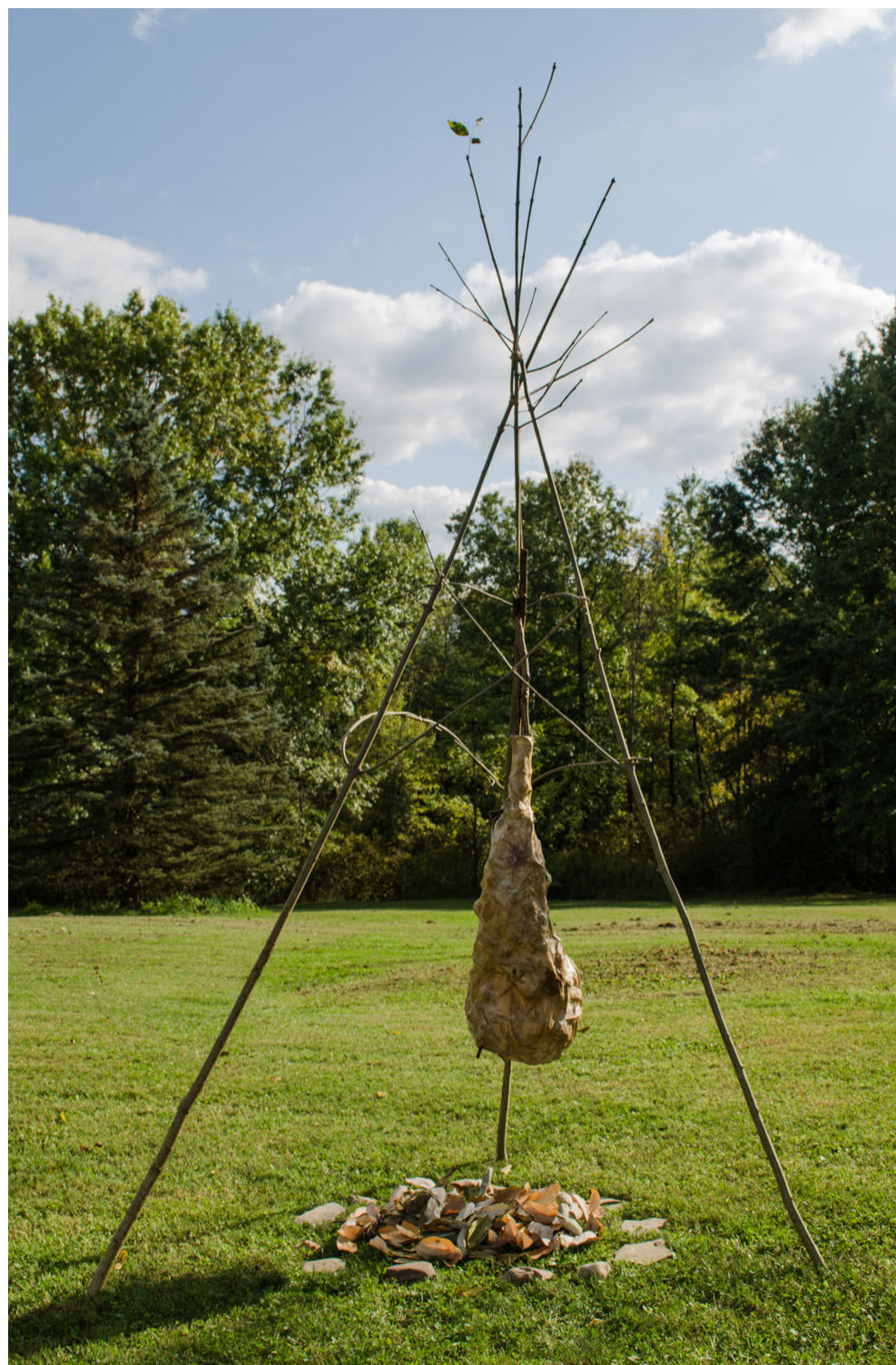
MEANDERINGS STICKS, VINE, SWEETGUM TREE PODS, LEAVES, PAPER, SINEW 120"H X 56"W X 46"D