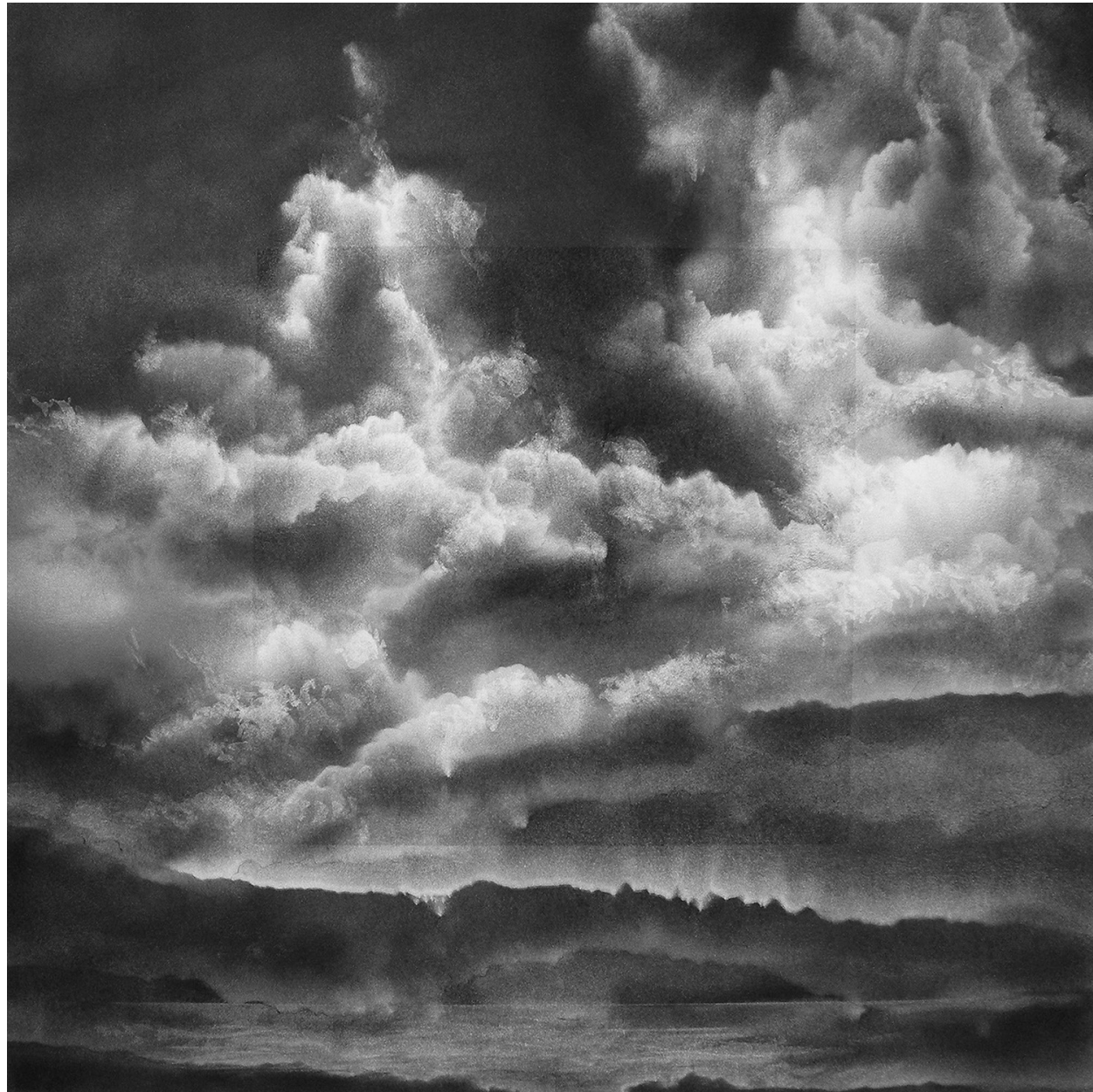
CARBON CONCERTO CARBON AND ACRYLIC ON COTTON MATBOARD 30" X 30"