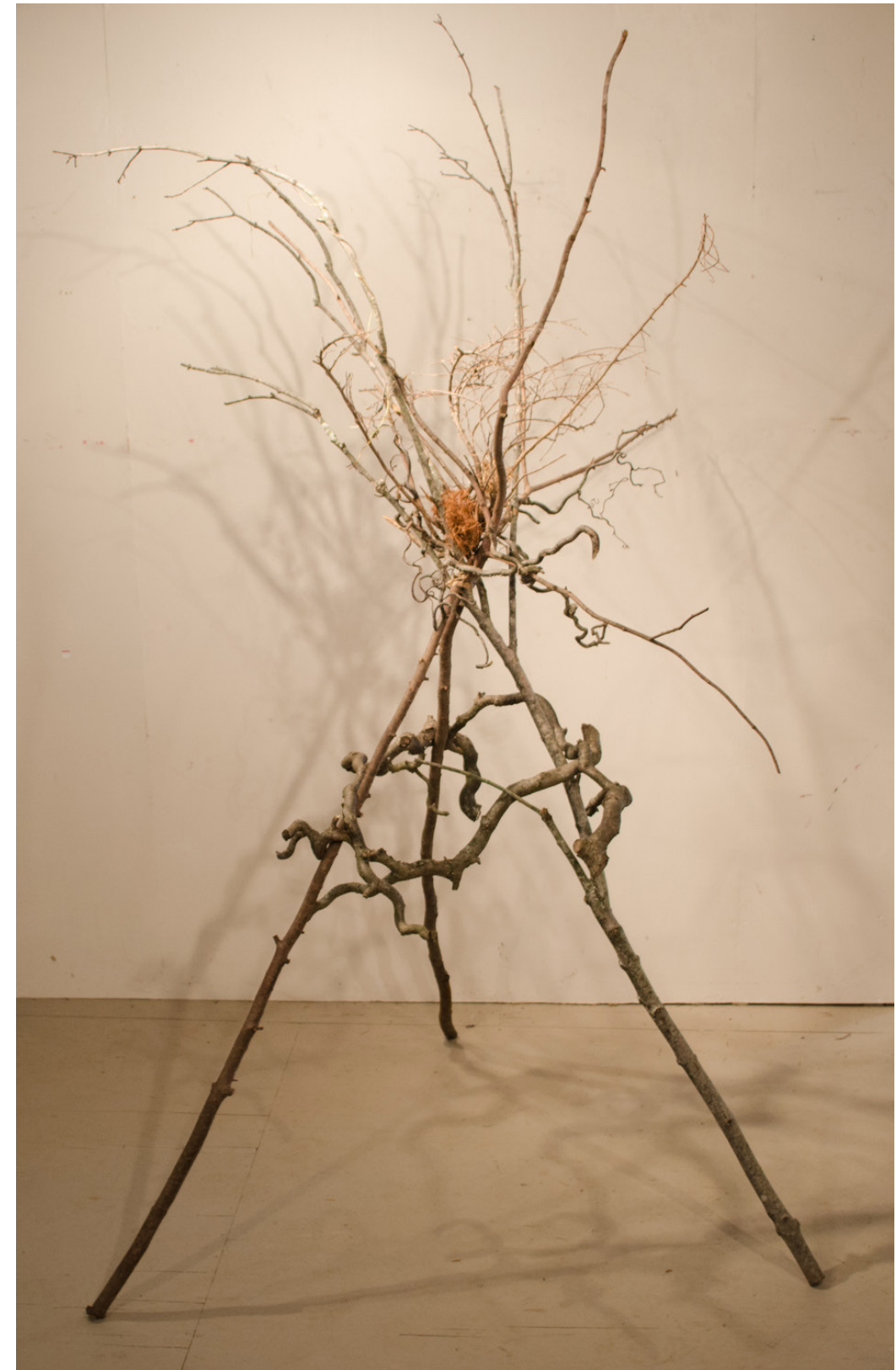
SHRINE STICKS, GRASS, SINEW 76"H X 47"W X 45"D

As an artist, I am a myth maker, constructing pieces that have significant ritualistic overtones. I hope to spark a visual conversation with the viewer, allowing them to engage and construct their own stories regarding my work.