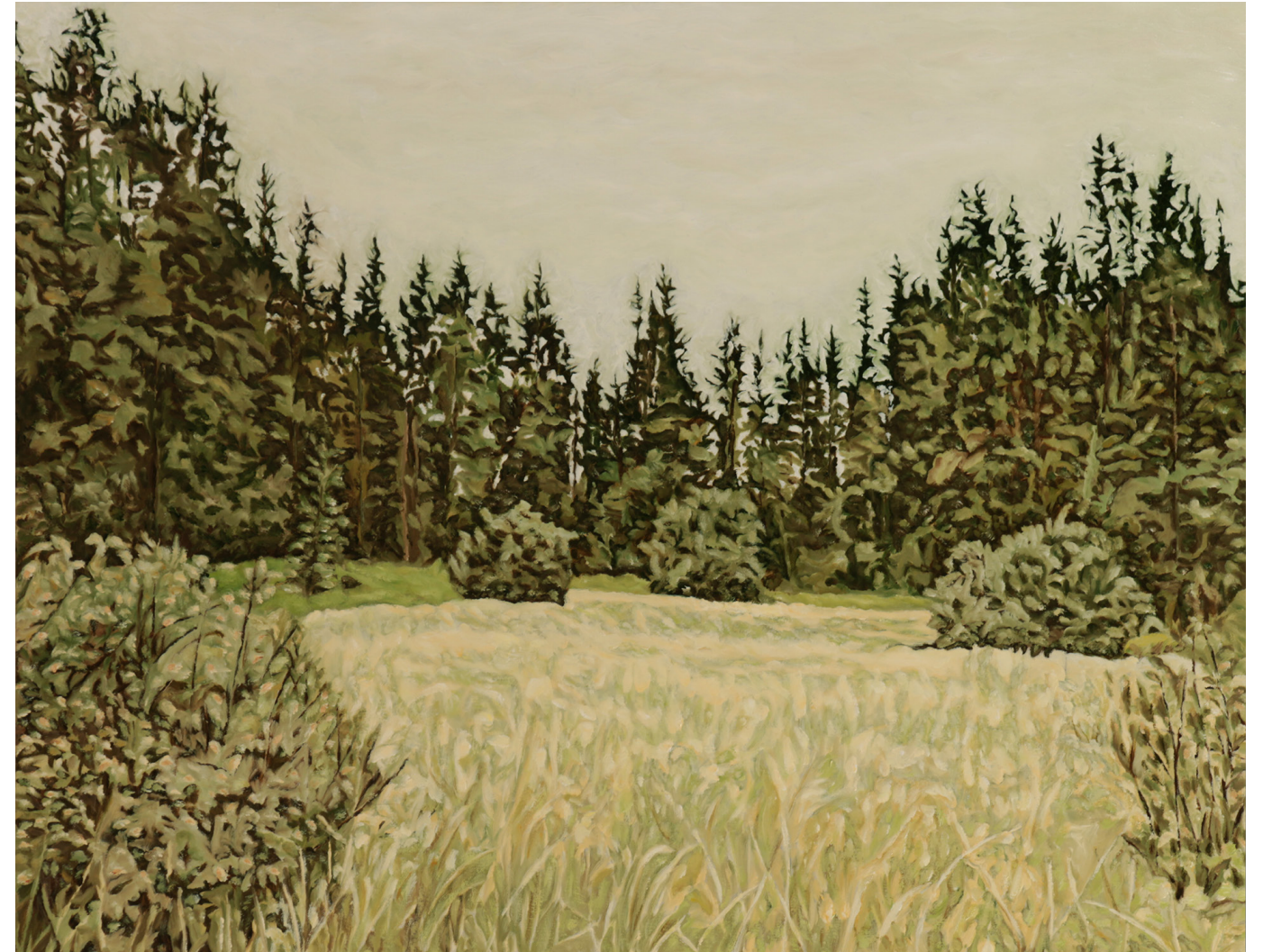
GLS 11 OIL ON CANVAS 36" X 28"