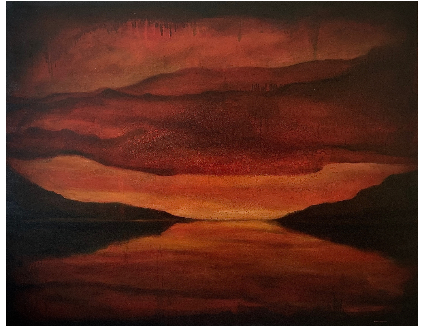
RED SKY AT NIGHT (RED SKY AT NIGHT, SAILORS' DELIGHT, RED SKY AT MORNING, SAILORS TAKE WARNING) OIL ON CANVAS 48" X 60"

I feel my paintings are peaceful and meditative, and it is my hope that they invite the viewer in, where the eye is allowed to rest on the horizon and the mind is allowed to wander.