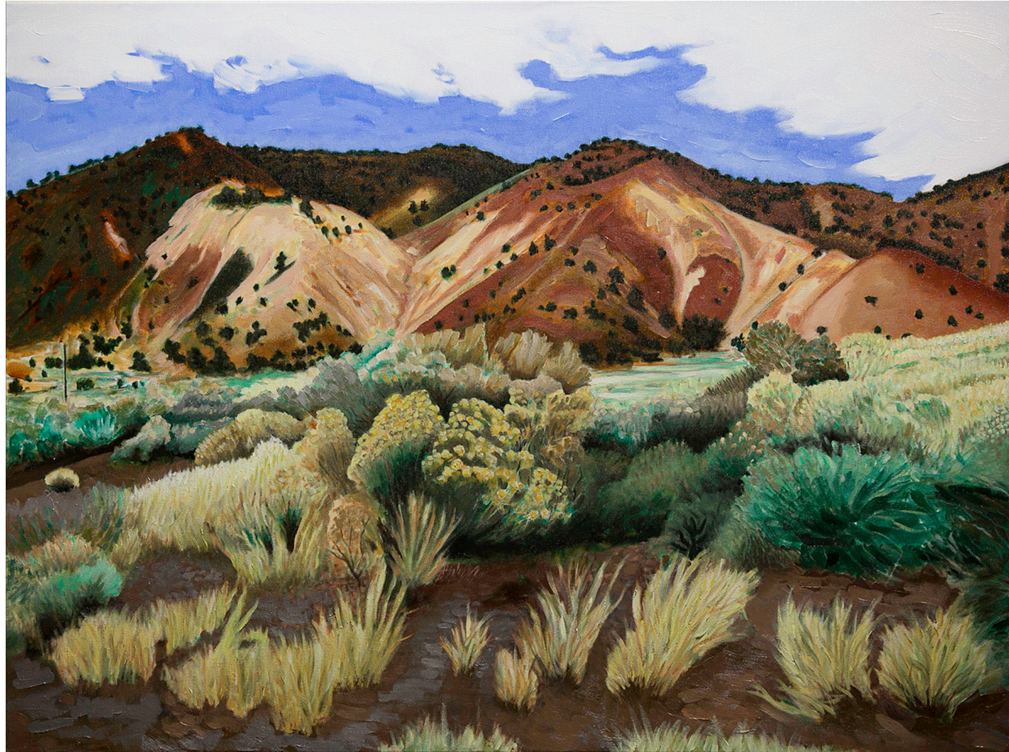
CHOCOLATE HILLS OIL ON COTTON 30" X 40"