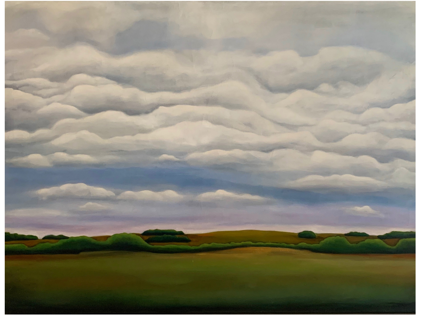
WHERE THE GRASS IS ALWAYS GREENER OIL ON CANVAS 36" X 48"