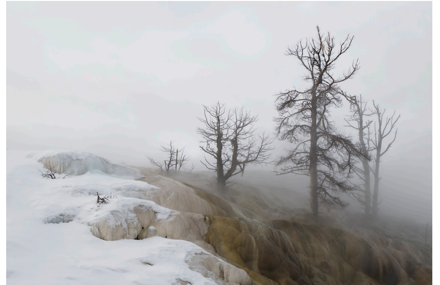
LANDSCAPE NO. 27 (WYOMING) INKJET PRINT, FACE MOUNTED TO PLEXIGLASS 23" X 34"