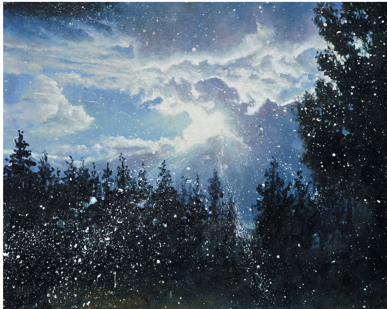
BOOM OIL ON CANVAS 12" X 15"

There is an aspiration to render the facts coherently. This occurs as essential but also as limited. In the desire to expand creative and expressive possibilities, opposing forces expressed as chaos or as intrusions are introduced. This is a merging and an expansion. It is the desire to express that which is greater than the sum of the parts and the play of light and dark of nature in its infinite capacities — both familiar and unknowable.